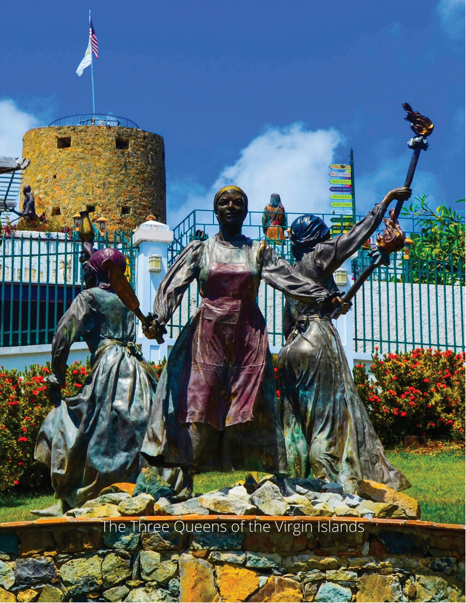
The Three Queens of the Virgin Islands